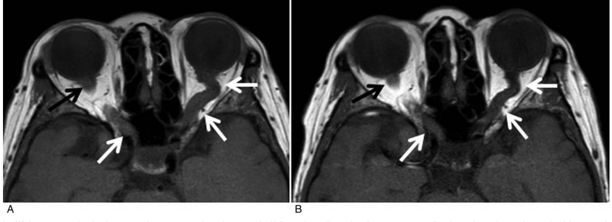
Figure 2. (A) At presentation brain magnetic resonance imaging revealed bilateral swelling of optic nerves extending from the retina to the optic chiasm and swelling of the left optic tract. T1-weighted image in the axial plane shows diffuse enlargement of both optic nerves (arrows). (B) Corresponding T1-weighted image in the axial plane of the same patient 3 months after treatment demonstrates decrease in the size of both nerves.