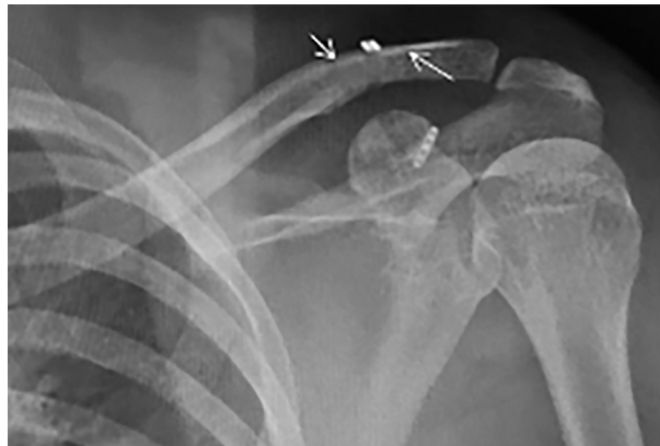
Fig. 3. Post operative X ray. TTDB inserting site was marked with white arrow.