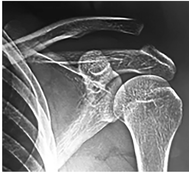
Fig. 2. Pre operative X ray. AC joint dislocation Rockwood type V.