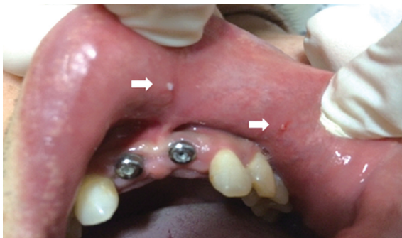
Fig. 2. Gross photograph showing mucosal invasion by the Anisakis larva (white arrows) seen as a white fragment in the upper labial mucosa.