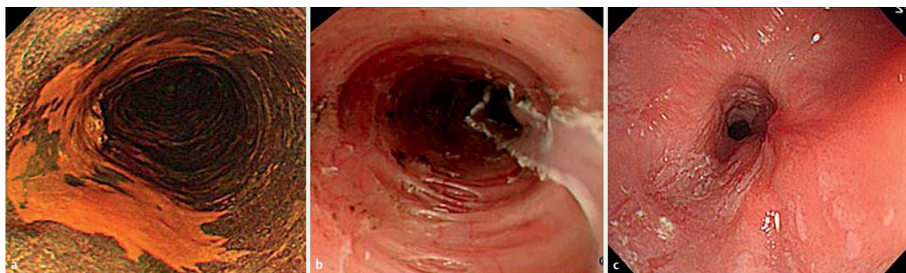
Fig. 2 Endoscopic views of the esophagus in a typical stricture case in the ESD alone group. a Chromoendoscopy with iodine staining revealed a discolored area in the mid-thoracic esophagus. The superficial esophageal cancer extended over three-quarters of the circumference. b Artificial ulcer immediately after endoscopic submucosal dissection (ESD), which resulted in a mucosal defect affecting more than three-quarters of the circumference. c Emergency endoscopy revealed a stricture 2 weeks after ESD. The patient experienced severe dysphagia.

portant that oral prednisolone is administered as soon as possible for the best outcome after ESD.