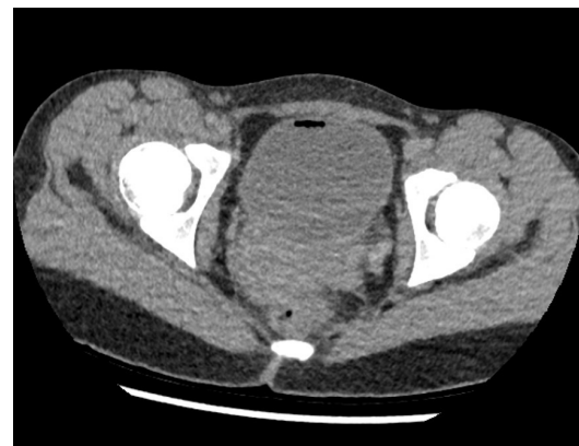
Figure 1 Axial CT scan showing gas-forming cystitis.

The patient was afebrile at the time of presentation and remained afebrile during the entire hospitalisation despite other evidence of significant systemic inflammation including a C-reactive protein of 22.4 mg/dL and a white blood cell count of 17 400/mcL with 74% neutrophils. Blood culture and metagenomic next-generation sequencing (mNGS) were not obtained. Urinalysis showed pyuria, haematuria, bacteriuria, leucocyte esterase, nitrites, 3+ketones and 3+glucose. A routine COVID-19 test through nasopharyngeal swab came back positive. Point of care glucose and an HbA1c were also 200 mg/dL and 9.1%, respectively. A venous blood gas revealed pH 7.32, partial pressure of carbon dioxide in venous blood (PVCO 2 ) of 36 mm Hg, partial pressure of oxygen in venous blood (PVO 2 ) of 72 mm Hg, bicarbonate 18.5 mmol/L, CO 2 20 mmol/L and a base deficit of -6.9. Serum ketones were negative. CT scans showed gas-forming cystitis (figures 1 and 2) along with bilateral attenuation suggestive of pyelonephritis. Pelvic