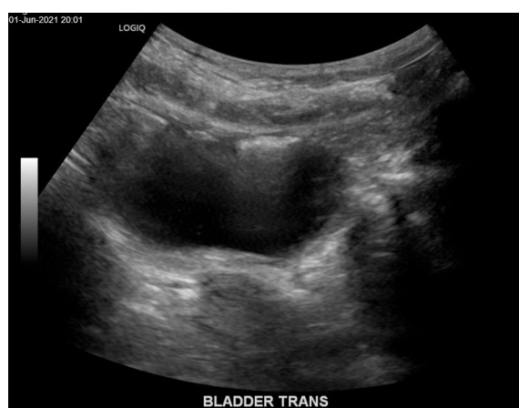
Figure 3 Pelvic ultrasound revealing increased echogenicity consistent with emphysematous cystitis.

ultrasound confirmed gas in the bladder (figure 3), with repeat ultrasound showing resolution 2 days later. Urine culture grew E. coli .