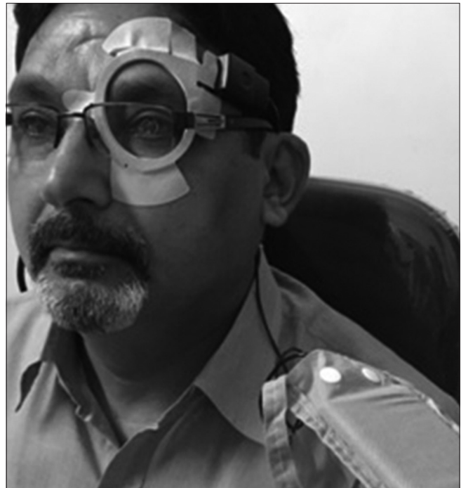
Figure 1: The wireless sensor is in place. A soft patch with antenna is applied around the eye and transmits the information to recorder that the patient wears in a pocket

As chi square test requires a large sample size of more than 30, we had taken 40 subjects who were long-term follow-ups