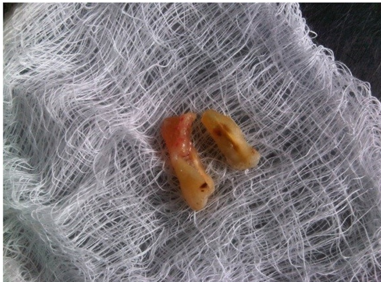
Figure 4 Split tooth segments post extraction.

history of masticatory accident as many factors related to cracked teeth are endemic to split teeth. Immediate pain during the incident which later subsided were reported and patients complained of marked pain on chewing and significant soreness of the jaw and gingiva. An important finding in this study was that most of the patients gave a three to six month history of a traumatic accident and intermittent pain. It implies that affected patients have either poor accessibility or high pain