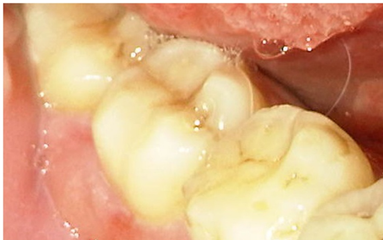
Figure 2 Split tooth with periodontal abscess.

In this study, patients gave a history of a masticatory accident and could remember biting hard on a piece of stone while eating a meal of rice, bread or beans. Others