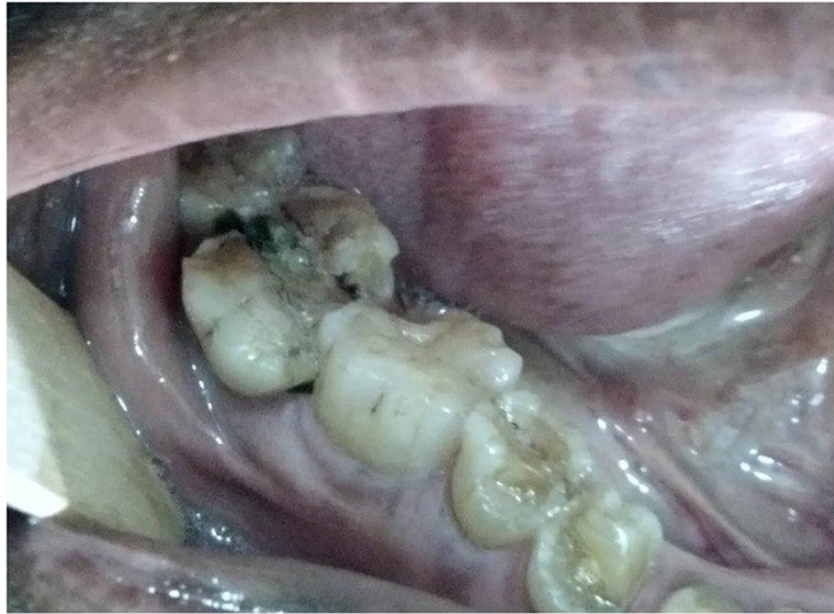
Figure 1 Split tooth with food particles.

Many morphologic and physical factors, such as deep grooves and pronounced intraoral temperature fluctuation may predispose posterior teeth to an incomplete fracture and subsequently to split tooth [18]. The prevalence of split tooth in this study was highest in the mandibular second molars (59%). The associated proximity to the temporomandibular joint based on the principle of the “lever” effect where mechanical force on an object is increased at closer distance to the fulcrum may be accountable for this [23]. Overall, the prevalence of split tooth in this study was higher in the mandibular molars when compared to the maxillary molars.