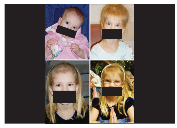
Figure 4: Pre- and post-operative head and eye profile picture of case number 2 showing the elimination of head tilt

muscle occasionally combined with a recession of the IR muscle.