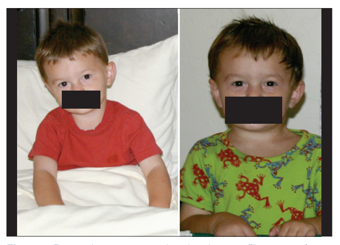
Figure 5: Pre- and post-operative head and eye profile picture of case number 6 showing the elimination of head tilt

Brown syndrome is one of the known complications of SO tendon tuck. In Helveston's series,<sup>[14]</sup> all developed a transient Brown syndrome. Persistent Brown syndrome was seen in 17% of their cases at an average of 9 months after the surgery, and they required a takedown procedure to reverse this complication. One case in our series developed Brown syndrome, but did not require a take-down of the tuck since he was asymptomatic.