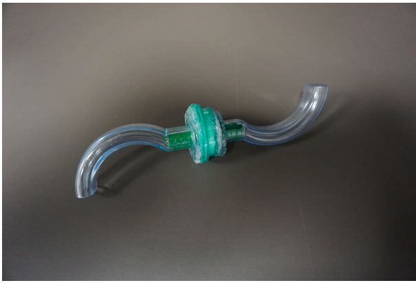
Fig. 1. Ventilation with Safar Ventilation Foil (SaVe Foil): S-shaped ventilation pipe made of two medium sized Guedel tubes and VT-30 Pediatric Neonatal Electrostatic Filter.

rescuer from airborne agents by removing aerosols from air leakage by adhesion and drainage below the barrier. We suggest that a tool of this kind be considered essential equipment and stored together with disposable gloves in AED public access locations.