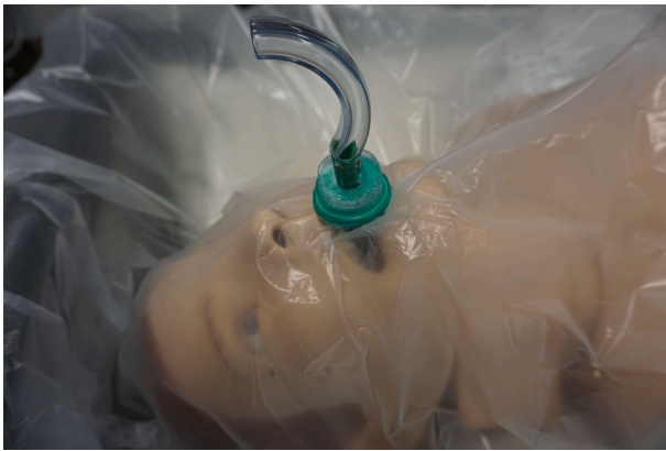
Fig. 2. Ventilation with Safar Ventilation Foil (SaVe Foil): A 120 × 120 cm polyvinyl chloride shield with the inserted centrally installed S-shaped ventilation pipe prior to mouth-to-pipe ventilation.