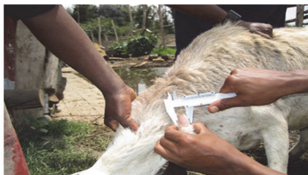
FIGURE 1: Increased thickness of skin fold of the middle neck of a sheep for comparative intradermal tuberculin test. Skin was swollen at bovine PPD injection site and the sheep was positive for tuberculosis.

at 60°C and then incubated in 1:4000 diluted streptavidin peroxidase (Boehringer) for 45 to 60 minutes at 42°C. The membrane was washed twice for 10 minutes in 2x SSPE-0.5% sodium dodecyl sulfates at 42°C and rinsed with 2x SSPE for 5 minutes at room temperature. Hybridizing DNA (presence or absence of the unique spacers) was detected by the enhanced chemiluminescence method (Amersham) and by exposure to X-ray film (Hyperfilm ECL, Amersham) which detects light signals and thereby produces a pattern that allows for typing of isolates as specified by the manufacturer.