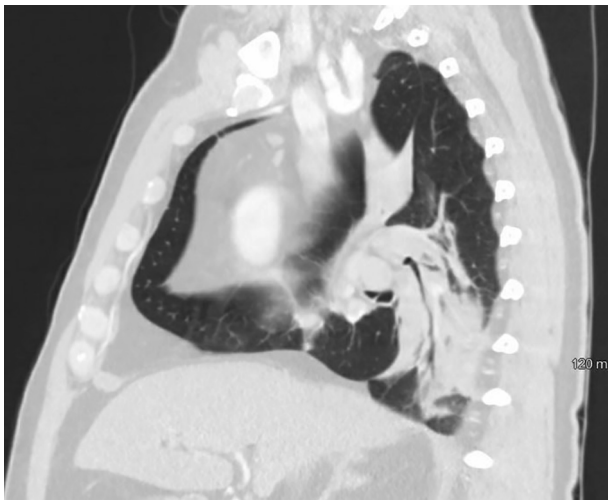
FIGURE 1. Additional sagittal projections further demonstrating bronchial and vascular rotation around the hilum with associated pulmonary consolidation.

postoperative day 3. The patient was evaluated in the clinic 2 weeks after surgery and did not have any recurrent pulmonary complaints. Institutional review board approval was not required because this project does not constitute human subject research. The subject provided informed written consent for the publication of the study data.