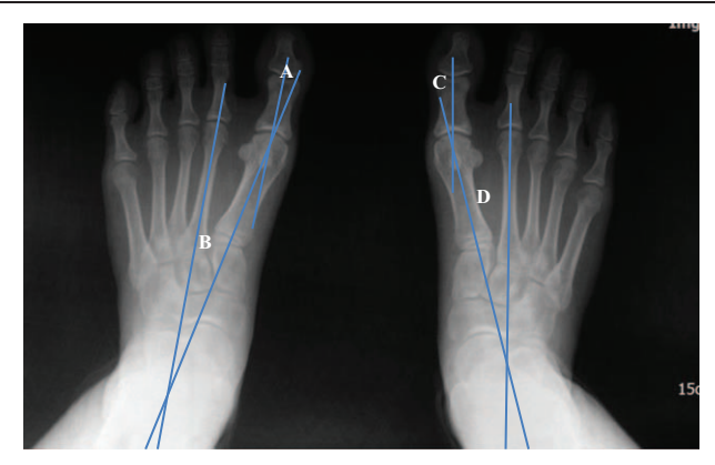
Figure 3. Final weight bearing radiographic view of both feet (A, left hallux valgus angle; B, left intermetatarsal angle; C, right hallux valgus angle; D, right intermetatarsal angle).

The balance taping was removed within 24 hours and reapplied every day, regardless of the presence or absence of skin itching.<sup>[6,7]</sup> As a result, there was no skin irritation or other adverse event.