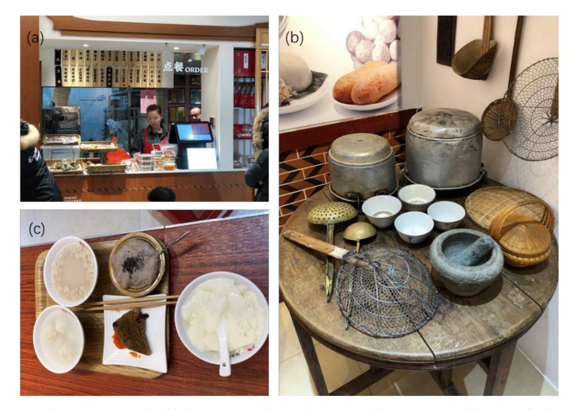
Figure 2. An illustrative example of ordering in a traditional restaurant that presents excellent tasty foods yet lacks information for health-conscious customers (to make better options on the sizes of the dishes and what portions of each may be consumed to make up a 'total' increase in the blood glucose level after the meal). (a) At the counter of the particular restaurant, the customers can see the wooden plates hung at the back (upper area of the photo), which are marked with the names of the dishes, to order the foods, showing the basic starch origins, such as glutinous rice, taro, wheat, black bean, green beans, etc. (b) As a part of the effort of showing the history of the restaurant, some of the traditional tools of making these tasty foods such as a stony grinder, sieves and pots, etc. One can imagine that the cooking facilities and the cooking procedures and flavor ingredients would be different too. (c) Some of the foods on a table in the restaurant as ordered by the first author, which are the favorites of this author.

To illustrate the rationale of this perspective, an example is shown in Figure 2 for a small yet delightful local restaurant in the ancient city Quanzhou in Fujian Province in China. The restaurant specializes in home-made starch variety-based foods. These are very tasty and traditional foods for the locals. The starches used for making different dishes are different, and the cooking methods/procedures are different as well. It is difficult to predict the GI or GL concepts for this kind of food outlet. Of course, this would also be common in other cultures. Following the suggestion in the current perspective, the product information, such as restaurant meals corresponding to Figure 2, can be made in a format that can be easily understood by a literate customer. The product information of the expected blood glucose rise can be shown on per serving basis (grams). This is perhaps the most reliable measure that informs a literate individual of what is going on after eating.