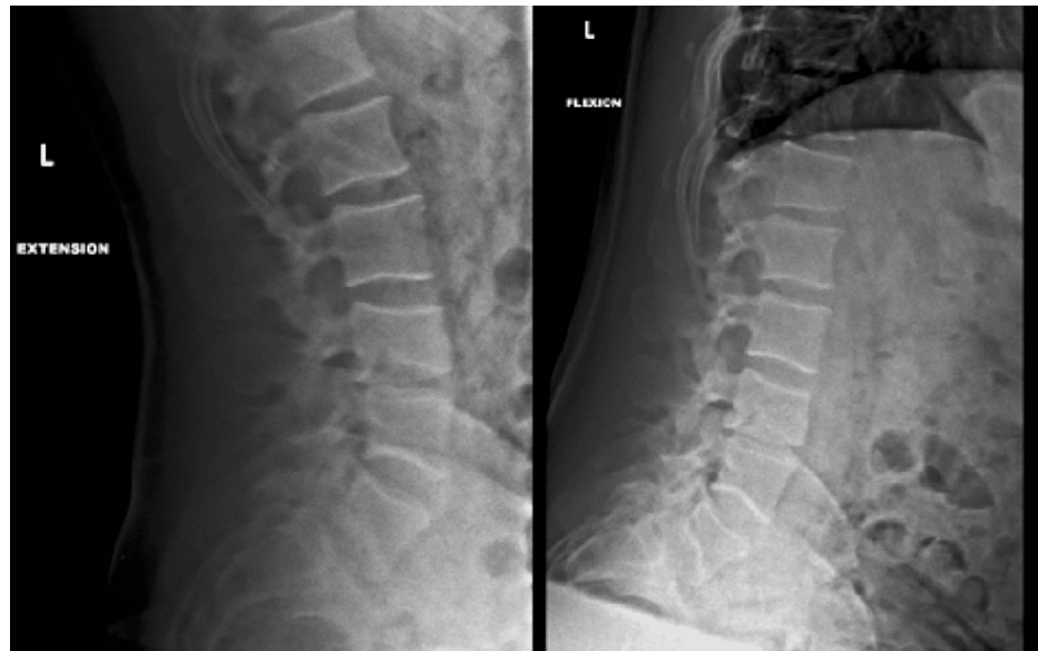
FIGURE 3: Follow-up flexion and extension X-rays 4 months post-injury demonstrating no mechanical instability