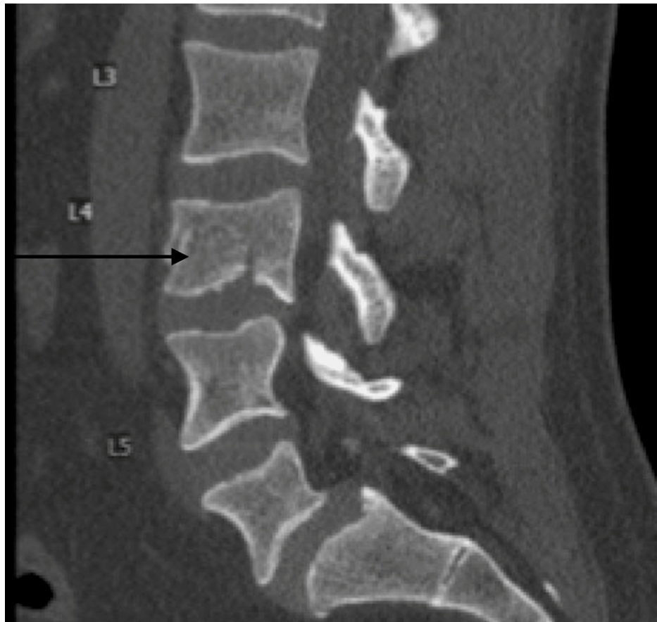
FIGURE 1: L4 burst fracture