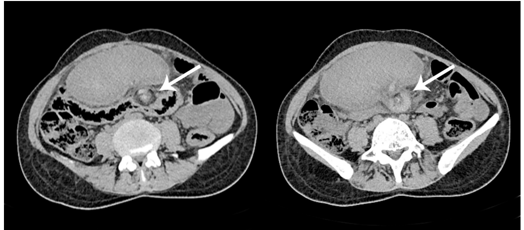
FIGURE 3: Non-contrast computed tomography images.

Non-contrast images confirmed the typical findings of an abnormally located spleen, with a hyperdense splenic pedicle and whorling of the vessels and fat, which were characteristic of torsion (Figure 3).