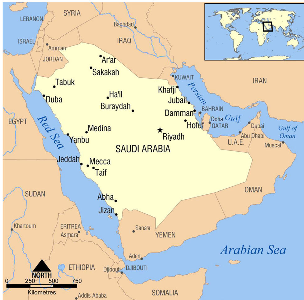
Fig. 1. Saudi Arabia Map.

With increased imports and decreased cultivation of high water requirement crops, the portfolio of the country's agricultural extension service has been greatly reduced (Baig et al., 2017). Agricultural extension services generally provide adult education to advance agriculture, though they assume diverse forms across countries. In the KSA, the focus has been on disseminating research-based information to farmers on topics including enhancing crop yields, conserving land and water, and other sustainable agriculture principles and practices (Baig et al., 2017; Al-Zahrani and Baig, 2014; Baig and Straquadine, 2014; Fiaz et al., 2016; Al-Shayaa et al., 2012). One possible new role, aligned with the goal of meeting the country's food security needs, is to bring staff expertise in community/adult education to address the country's waste of food.