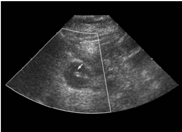
Figure 3. Ultrasound image immediately following thrombin injection demonstrates needle (arrow) within the aneurysm, showing that blood flow has ceased.

A total of 1500 units of thrombin diluted in 1.5 cc's of saline was injected into the aneurysm causing its complete thrombosis. The splenic artery remained patent during the procedure, and the patient remained asymptomatic.