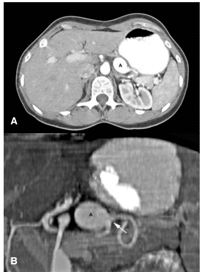
Figure 1. Enhanced CT, in both the axial (A) and coronal oblique (B) planes, demonstrates a saccular aneurysm (A) from the middle third of the splenic artery (arrow).

the middle third of the splenic artery (Figure 1) and was