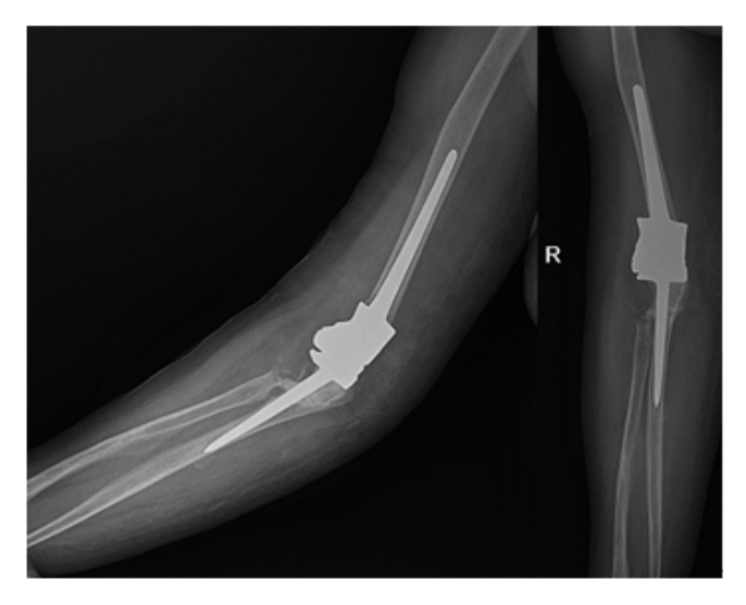
Fig. 4. Immediate postoperative X-ray after total elbow replacement.

such as debridement, synovectomy, and arthroplasty, when needed [1]. The final functional outcome depends on the stage at which the diagnosis was made. When diagnosed early and treated with ATT, results for osteoarticular TB diagnosed can achieve near-normal joint function. However, the result of advanced osteoarticular TB is usually poor [1]. An osteoarticular TB with bony/fibrous ankylosis that has healed can be treated with ar-