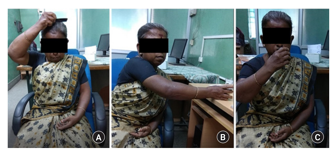
Fig. 6. Follow-up images demonstrating the patient's range of movements postoperatively. The patient reported that she was able to comfortably comb (A), stretch to lift a tumbler (B), and drink water using the affected side (C).

of 72% to 97% in osteoarticular TB. A study by Jain et al. [8] reported a 100% positivity rate from fine-needle aspiration and histopathology. Arthroscopic synovial biopsy is considered to be the best method because the lesion is visualized before the biopsy is taken [9]. However, in endemic countries, even after a negative biopsy, the possibility of TB should not be ruled out. This conclusion is further strengthened by the study of Bae et al. [10], which analyzed 227 biopsy specimens and concluded that in areas of high TB prevalence, TB should not be ruled out even if the biopsy specimen does not show classical granulomatous inflammation or caseous necrosis. We did not perform an open biopsy after the negative first arthroscopic biopsy because arthroscopic biopsy sample adequacy. Further, the diagnosis is particularly challenging in atypical presentations without any pre-existing TB lesions (primary TB). Therefore, recommendations for clinicians that assess future cases are to: (1) include a bone biopsy when performing an arthroscopic synovial biopsy (the combined biopsy might increase the positivity rate) and (2) discuss similar rare presentations in clinic-pathological meetings and seek guidance for further recommendations.