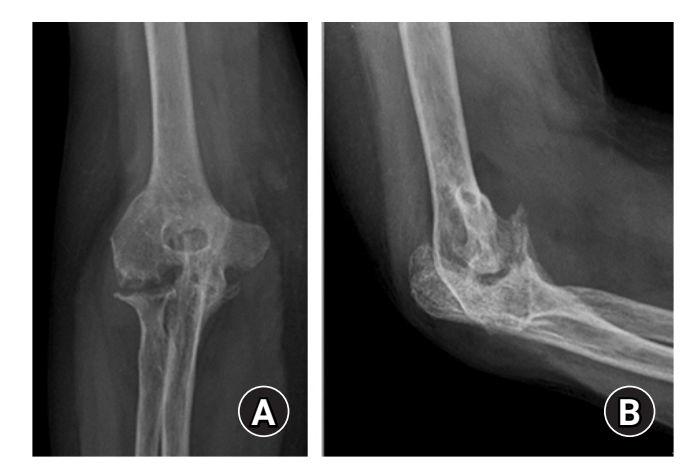
Fig. 1. Plain radiograph demonstrated loss of joint space with the destruction of articular ends of the distal humerus, radial head, and proximal ulna. (A) Anteroposterior radiograph on the right showing loss of joint space and arthritis. (B) Lateral radiograph on the left showing destruction of articular ends of the distal humerus, radial head, and proximal ulna.

Under general anesthesia, the patient was positioned in the left lateral position. Through the posterior approach, the triceps was exposed and retracted laterally. The ulnar nerve was exposed and secured. The distal humerus cut was made just above the olecranon fossa. The radial head was excised above the annular ligament attachment. A subarticular L-shaped cut of the proximal ulna was made to protect the triceps and brachialis attachments. The medullary canals of the ulna and humerus were reamed with