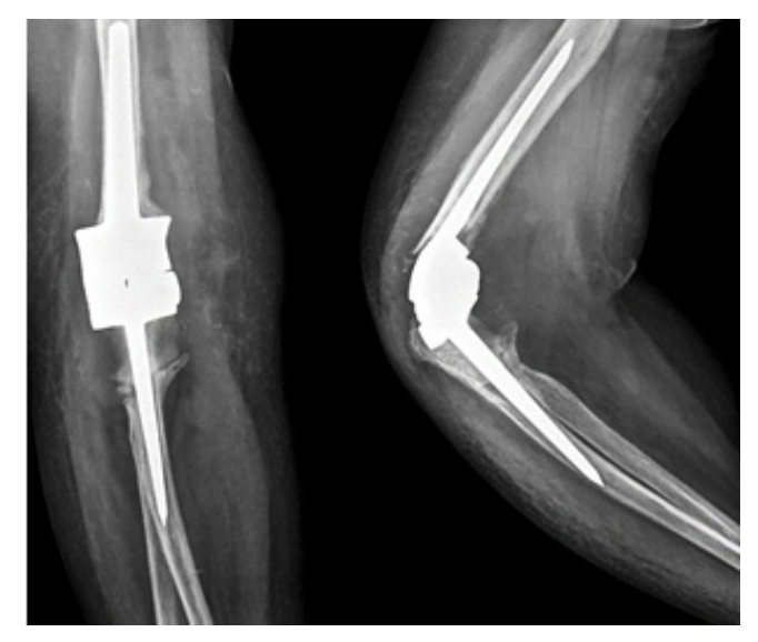
Fig. 5. Follow-up X-ray 3 years after surgery with no signs of loosening.

such as debridement, synovectomy, and arthroplasty, when needed [1]. The final functional outcome depends on the stage at which the diagnosis was made. When diagnosed early and treated with ATT, results for osteoarticular TB diagnosed can achieve near-normal joint function. However, the result of advanced osteoarticular TB is usually poor [1]. An osteoarticular TB with bony/fibrous ankylosis that has healed can be treated with ar-