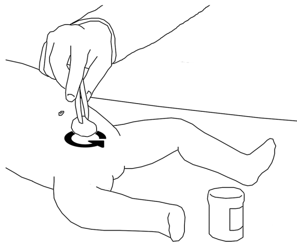
Figure 2 QuickWee method of suprapubic cutaneous stimulation with saline-soaked gauze.

Additional suprapubic cutaneous stimulation will be performed using a designated pack containing