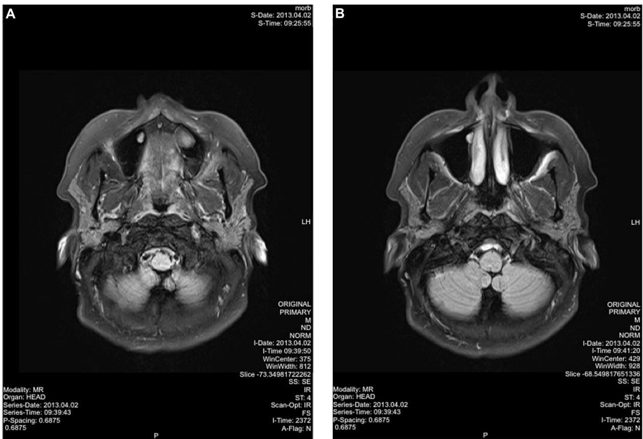
Figure 5 Horizontal sections from the corresponding cheek area without CaHA.

Notes: (A,B) MRI images acquired approximately 2.5 years after CaHA injection with a Siemens Magnetom Skyra 3.0 Tesla. No CaHA was detectable in any of the corresponding MRI sections.