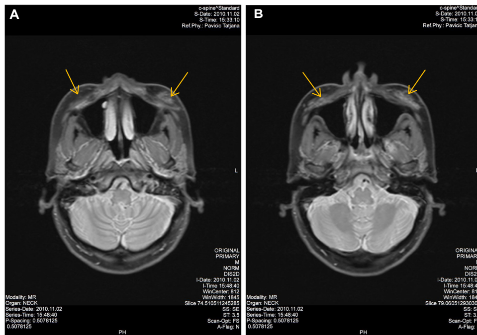
Figure 4 Horizontal sections from the cheek showing CaHA over a certain area corresponding the 3-dimensional cheek volumetry.

Notes: (A,B) MRI images acquired immediately after injection of CaHA for the cheek augmentation with a Siemens Magnetom Essenza 1.5 Tesla. Product shown over two MRI sections.