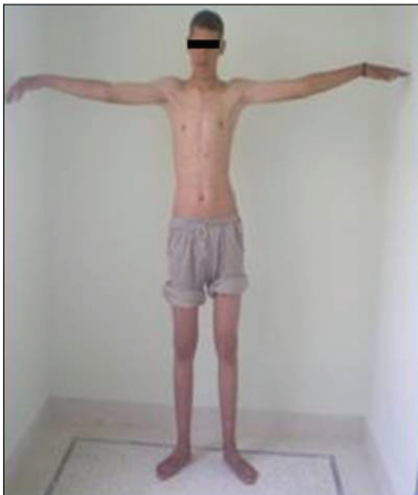
Figure 1: Long-legged (height of 1.84 m) patient with raised elongation rate (1.06 m)

angiographies of the supra-aortic trunk were normal. The thoracic CT-scan angiography did not show dilatation of the aorta, while the abdominal CT-scan angiography demonstrated infarction of spleen and both the kidneys. Diagnosis of Marfan syndrome with infectious endocarditis complicated by ischemic stroke was retained. However, the family pathological history was negative. The diagnosis of Marfan syndrome was confirmed considering the following findings: Ligamentous hyperlaxity, crystalline ectopia and mitral valve prolapsus with mitral insufficiency. The patient benefited from antibiotherapy for 4 weeks. He also underwent sessions of motor physical therapy and orthophonic rehabilitation. Then, the cardiac surgery was carried out and valvuloplasty was performed [Figure 4]. The surgical treatment confirmed the presence of mitral insufficiency and prolapsus of the big mitral valve and multiple friable anterior–posterior vegetations with broken cordage of the small mitral valve [Figure 4]. The post-surgery follow-ups were simple. The evolution