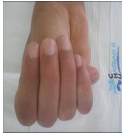
Figure 2: Sign of the thumb: The distal phalanx of the thumb can be joined beyond the ulnar border of the palm