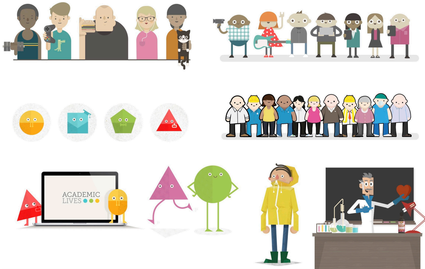
MORPH DESIGN DEVELOPMENT CLIENT: TRECA 10-08-2016 Morph - The Storey - Meeting House Lane - Lancaster - LA1 1TH www.morph.co.uk • info@morph.co.uk • 01524 509006 VAT Reg: 100 5588 48 Morph Studio is a partnership.