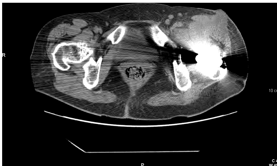
Figure 1 A computed tomography scan image of hip arthroplasty. Evidence of a periprosthetic abscess with diffusion to the left psoas muscle and cutaneous fistula is shown.

and appeared to be completely healed after six months. Our patient was totally asymptomatic and without pain upon hip movements after 15 months. The iliopsoas abscess was no longer evident on a CT scan performed about one year later.