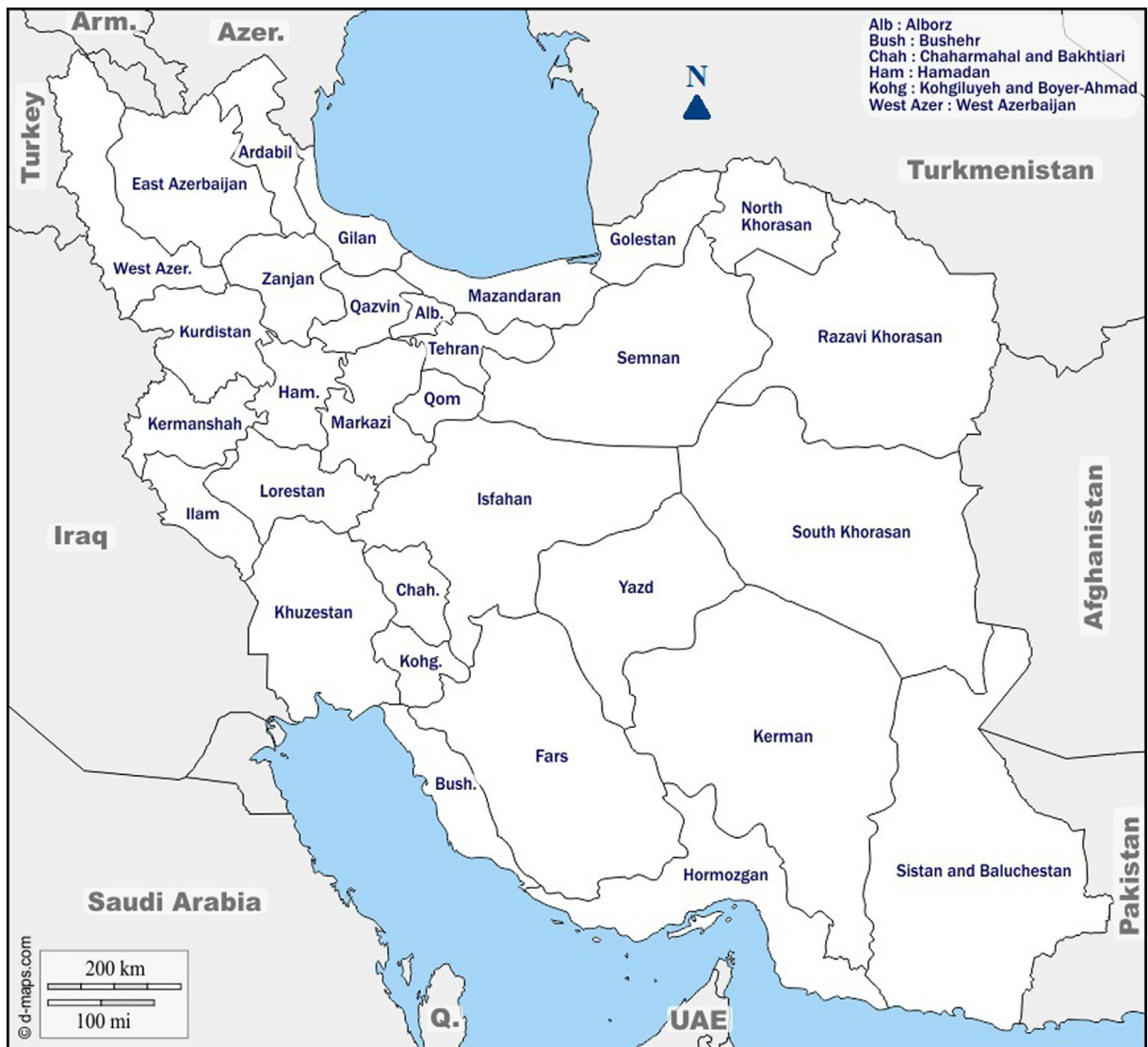
Fig. 1. Map of Iran and geographical situation of malaria endemic areas of this country namely Sistan and Baluchestan, Hormozgan and Kerman provinces, as well as two main foci of visceral leishmaniasis (VL): one in Fars Province and the other in Ardabil Province.

In Iran, malaria is endemic in the southeast of country consists of Sistan and Baluchestan, Hormozgan and Kerman provinces (Fig. 1) (Piroozi et al., 2019). According to the global report of the WHO, 939 malaria cases were reported in 2017, of which 57 (6.07%) were autochthonous cases (World Health Organization, 2018). Toxoplasmosis has been reported in all areas of Iran and the performed studies showed a high seroprevalence among the general population (Daryani et al., 2014; Foroutan et al., 2018). Visceral leishmaniasis is endemic in some parts of Iran and 100–300 new cases are reported every year (Mohebbi, 2013; Shokri et al., 2017). As TTPI, of these diseases, only malaria has been reported in Iran (Mardani et al., 2016).