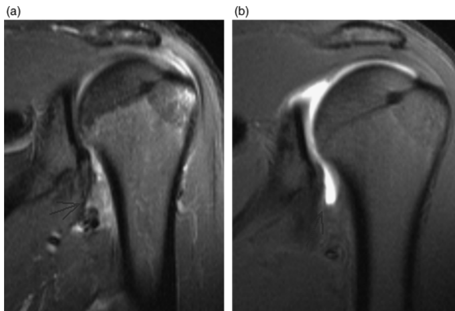
Fig. 2. A posterior anterior glenohumeral ligament (HAGL) lesion disappearing after 31 days. The figure shows the images from the shoulder of a 29-year-old male after primary traumatic anterior dislocation of the left shoulder. (a) Oblique coronal STIR (3000/37) 8 days after dislocation of the left shoulder reveals a posterior HAGL lesion. (b) Oblique coronal T1 fat sat (600/11) with intraarticular contrast medium obtained 31 days after the dislocation demonstrates full recovery.

lesion (Table 2). We found these lesions in nine of the 11 patients with small or absent Hill–Sachs lesions compared with five of the 31 patients with moderate or large Hill–Sachs lesions, P < 0.001 (Table 2). The difference in the number of Bankart lesions found on MRI and MRA was also significant, P = 0.000 .