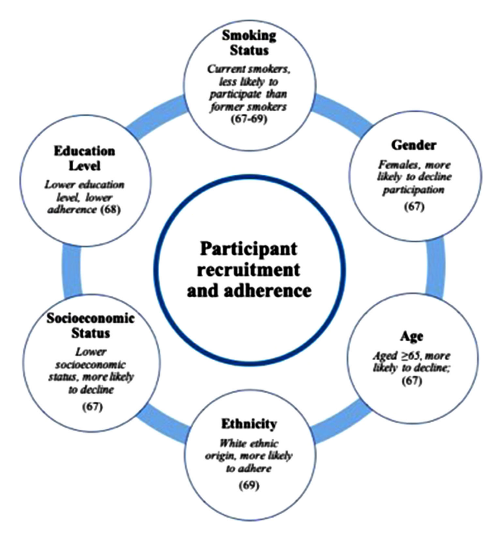
Fig. 3 Summary of factors associated with participant recruitment and adherence in low-dose computed tomography lung cancer screening programs.

screened versus control group, respectively (OR 2.38; 95% CI, 1.56–3.64, p < 0.001). In this trial, participants requiring additional investigations had an increased likelihood of quitting long term when compared with the control group (OR 2.29; 95% CI, 1.62–3.22, p = 0.007) [81]. In the NELSON trial, the screening group also reported high smoking abstinence rates (14.5%); however, higher rates were still seen in the control group [82].