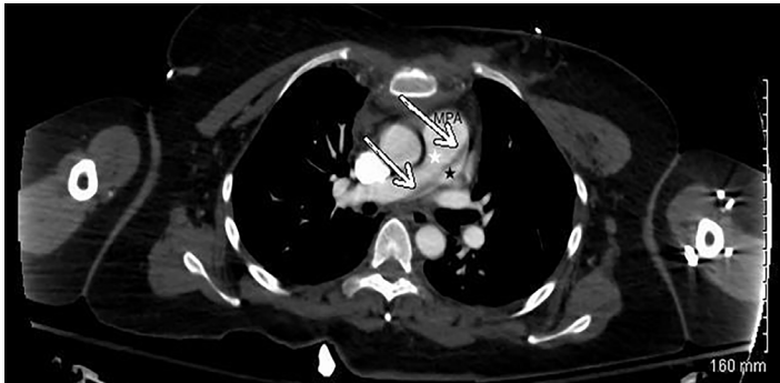
Image 2. Computed tomography angiography of the chest with intravenous contrast in axial view showing displacement of the left atrium (arrows). True (white star) and false (black star) lumens can also be visualized.

Since the PAD was deemed stable, an exploratory laparotomy was performed for clinical as well as radiographic findings, revealing 3 areas of mesenteric avulsion resulting in small bowel resection and control of hemorrhage. A damage control procedure was done with temporary abdominal closure, remained intubated and was transferred to an outside facility where she was lost to follow-up.