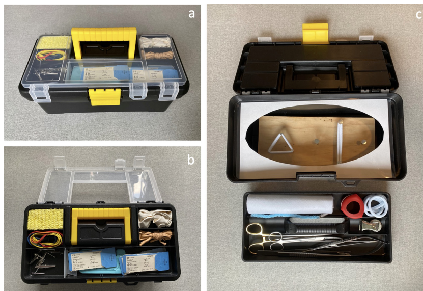
FIGURE 1. GlobalSurgBox Components

(a) The GlobalSurgBox is a comprehensive surgical trainer that fits within a toolbox. (b) The lid holds all the necessary materials for building and performing the training modules. (c) A removable tray holds the necessary surgical instruments, including several different types of needle drivers, forceps, and scissors, while a removable wooden board located at the base of the toolbox serves as the foundation for individual training exercises.