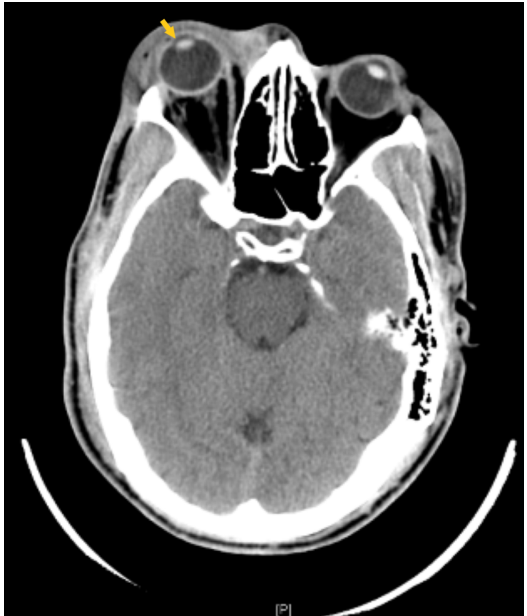
FIGURE 3: CT demonstrating right exophthalmos (arrow) with intraorbital fat stranding and abnormal caliber and density of the optic nerve sheath complex. Also seen is right preseptal subcutaneous soft tissue swelling and hematoma.

Upon talking with the transferring physician, we learned that the patient had nearly complete loss of vision in the affected eye. Knowing that orbital compartment syndrome can cause permanent ischemic changes as quickly as within 60 minutes of onset, my attending physician requested that a lateral canthotomy procedure be performed prior to transfer. We were able to walk the transferring physician through the procedure (Figure 4).