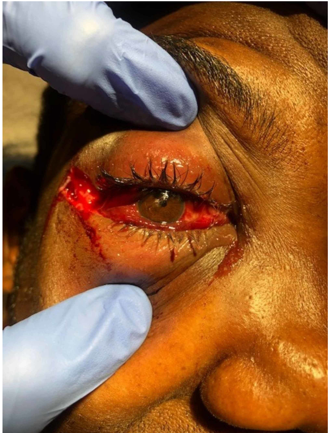
FIGURE 2: Patient with eye propped open by examiner

Computer Tomography (CT) scan of the head, orbits, and maxillofacial bones were obtained which revealed right exophthalmos with intraorbital fat stranding and abnormal caliber and density of the optic nerve sheath (Figure 3). The decision was made to transfer the patient to our facility for ophthalmology evaluation.