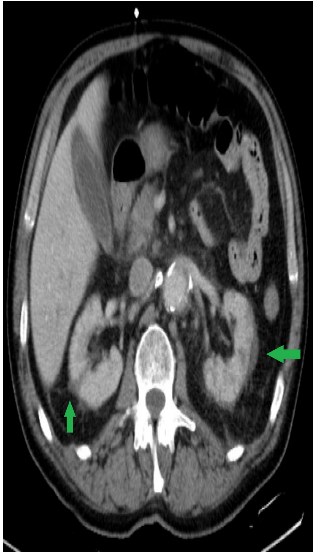
FIGURE 3: Renal infarcts