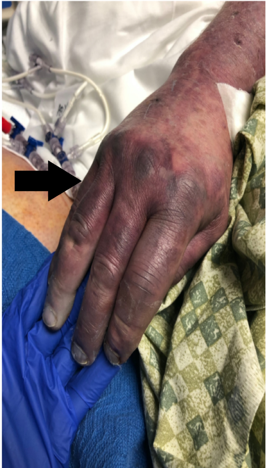
FIGURE 2: Peripheral cyanosis - Ischemic hand