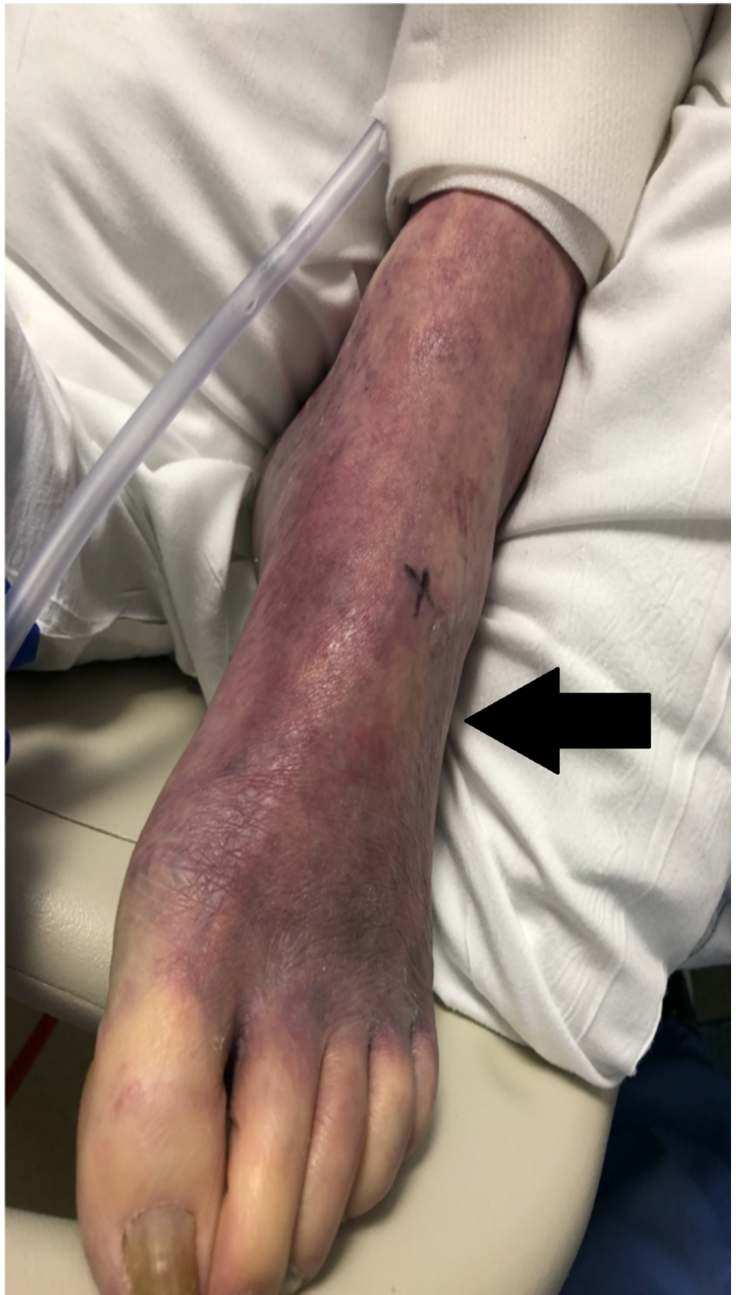
FIGURE 1: Peripheral cyanosis - Ischemic leg