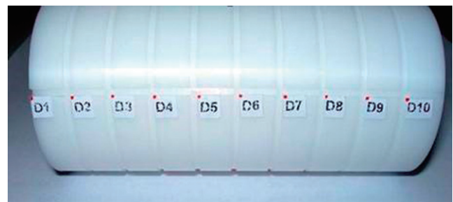
Fig. 3. Identifying coordinates of the phantom.