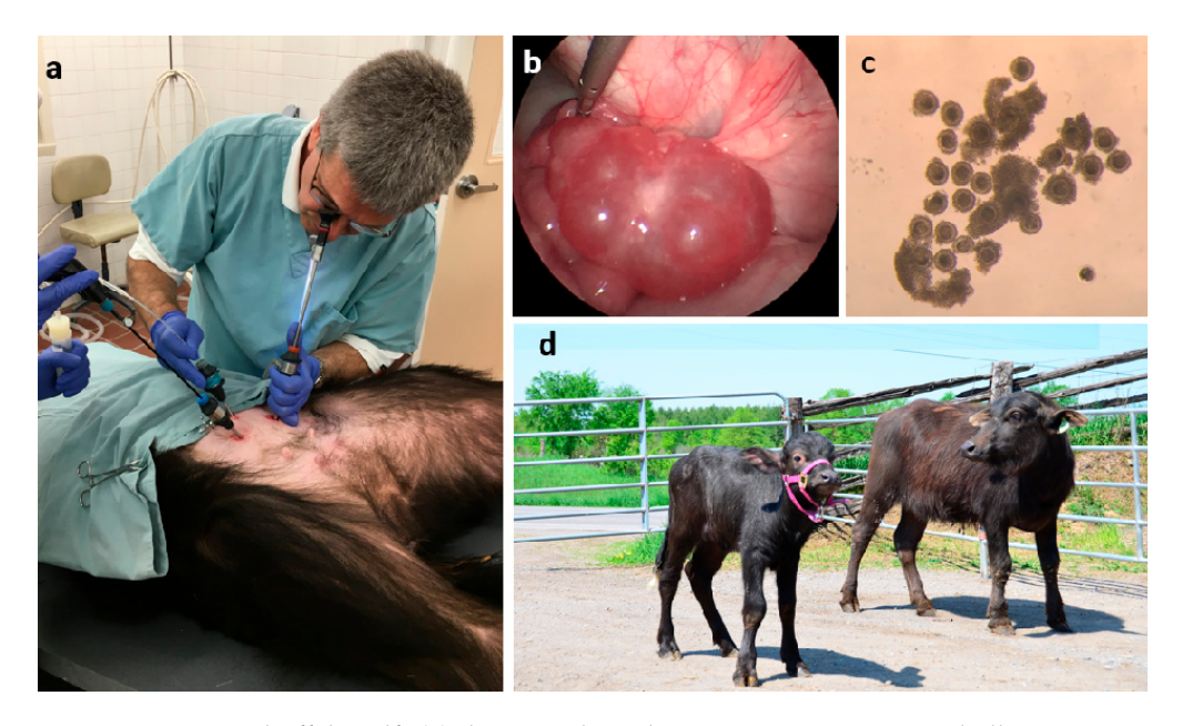
Figure 2. LOPU in buffalo calf: ( a ) the procedure showing port insertion and all instruments in place; ( b ) endoscopic view of hormonally stimulated ovary ready for LOPU with multiple follicles of >5 mm; ( c ) cumulus–oocyte complex recovered from buffalo calf; ( d ) "Jeanette" (left), the first buffalo born in North America by applying LOPU-in vitro embryo production (IVEP) in a prepubertal donor is pictured here with her genetic mom "Quiche" (right), who was only 4 months of age when she donated the oocytes.

The procedure is minimally invasive and has been shown to be very safe, specifically with no intraoperative complications nor sequels with the potential for impact on the reproductive future of the animals. In goats, it has been repeated ~10 times in the same year without issues nor a decrease in response and recovery rate [52]. Similarly, no sequels of concern were observed in sheep subjected to repeated LOPU [10]. In prepubertal cattle and buffalo, we conducted between 6 and 9 LOPU procedures/animal in a 3–4 month