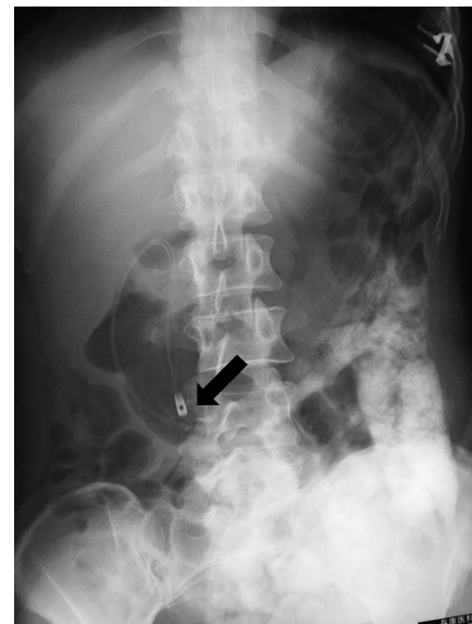
Fig. 2. Representative image of an abdominal plain X-ray performed 24 h later. We confirm the tip of the feeding tube located in the proximal jejunum regurgitation of the contrast medium into the stomach. Arrow indicates the tip of the feeding tube located in proximal jejunum.

case, “double-check” endoscopy revealed an incorrect position of the feeding tube, and replacement was undertaken immediately. The average procedure time (including the first placement and replacement of endoscope) was 13.1 \pm 2.3 min (ranging 10 to 17 min). In all patients, contrast agents passed to the ileum 24 h later, as verified by portable plain X-ray (Fig. 2).