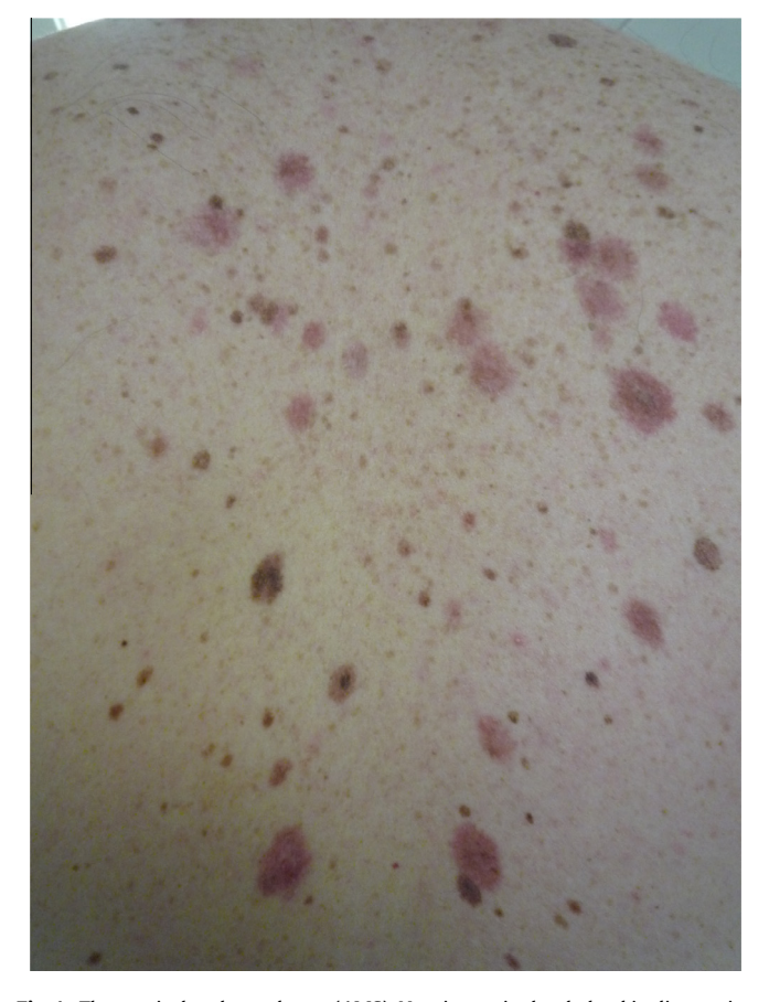
Fig. 1. The atypical mole syndrome (AMS). Naevi genetics has helped in discovering new melanoma genes but this phenotype is also helpful as it does unravel some associations between melanoma risk factors and other phenotypes such as reduced ageing and longer telomeres.

The number and types of naevi (such as atypical naevi) is the strongest risk factor for melanoma in all Caucasian populations and the magnitude of the odds ratios (5-20) is much greater than any odds ratios ever reported for sun exposure and skin colour (1.5-2) (Fig. 1) [12,13]. Naevi confer the same magnitude of risk for melanoma at all latitudes showing again that sunlight is not that important for this association [14]. Looking into the biology of naevi is likely to lead to very interesting clues regarding the pathogenesis of melanoma. Melanocytes derive from the neural crest cells and their differentiation and migration to the skin occur during embryogenesis. This involves many genes such as MITF, WNT signalling, SOX10 and SOX 9 to mention only a few [15]. Interestingly, one of these genes, MITF has recently been reported to be involved later on in adulthood in melanoma susceptibility and invasion [16,17]. BRAF somatic mutations are also very common in naevi and melanoma and this led recently to the first therapy ever conferring an increased survival in melanoma [18,19]. Bastian and colleagues have looked at genetic signatures in melanoma tumours according to histological subtypes and body sites [20]. BRAF mutated melanomas are more common on the trunk and limbs compared to head and neck tumours and this again was thought to be due to differences in sun exposure but this