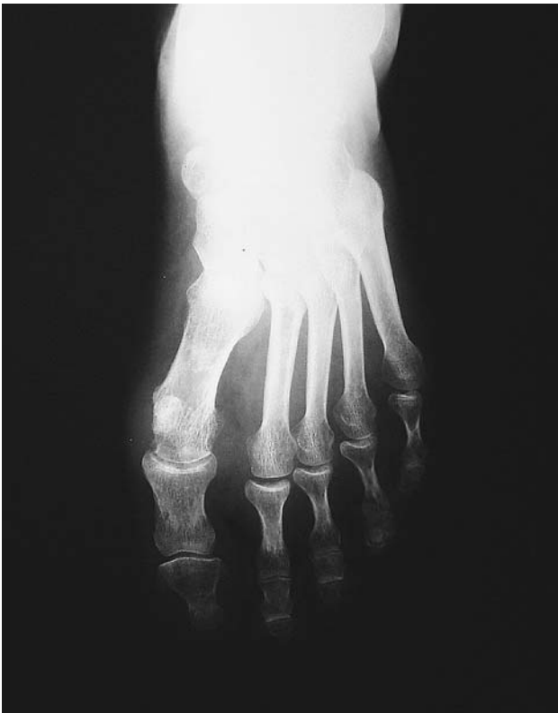
Fig. 2 AP X-ray 36 months later postoperatively; good result