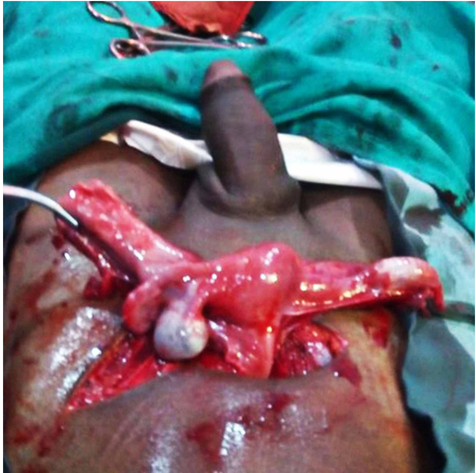
FIGURE 1: Intra-operative picture showing small uterus with bilateral tubes and ovaries, phallus