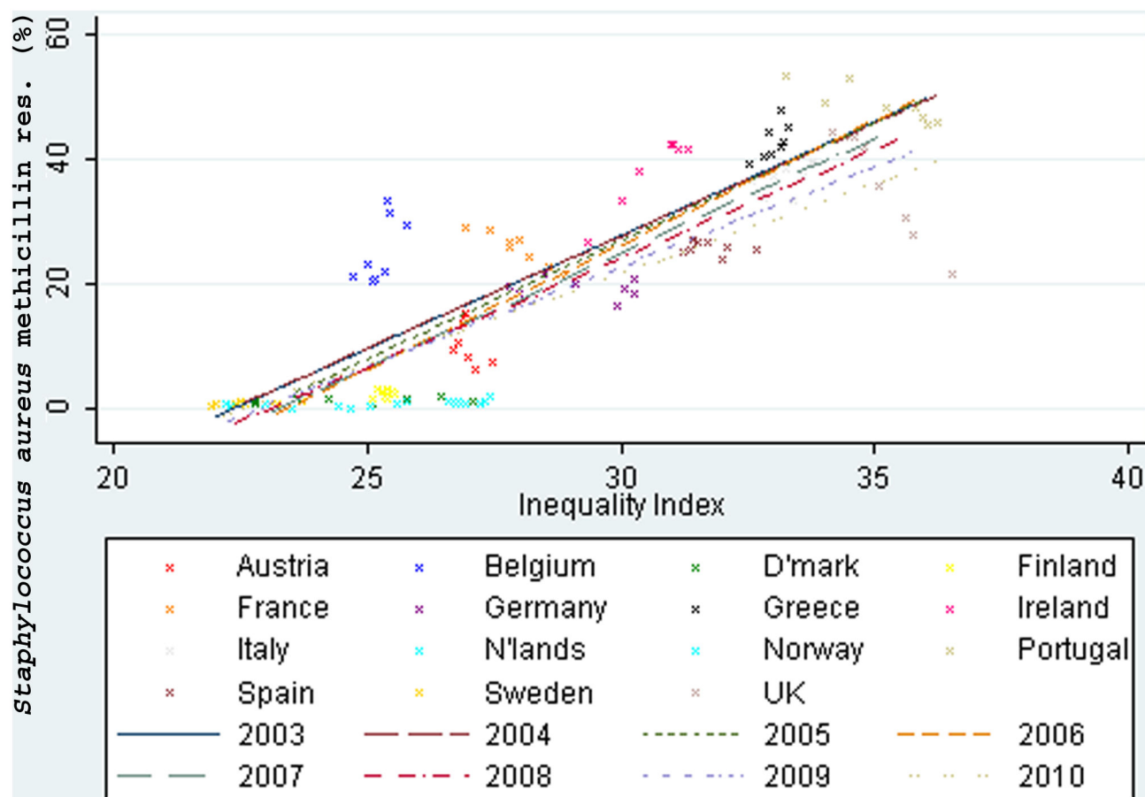
Figure 4. Income inequality correlated with methicillin resistance in Staphylococcus aureus (2003-10).