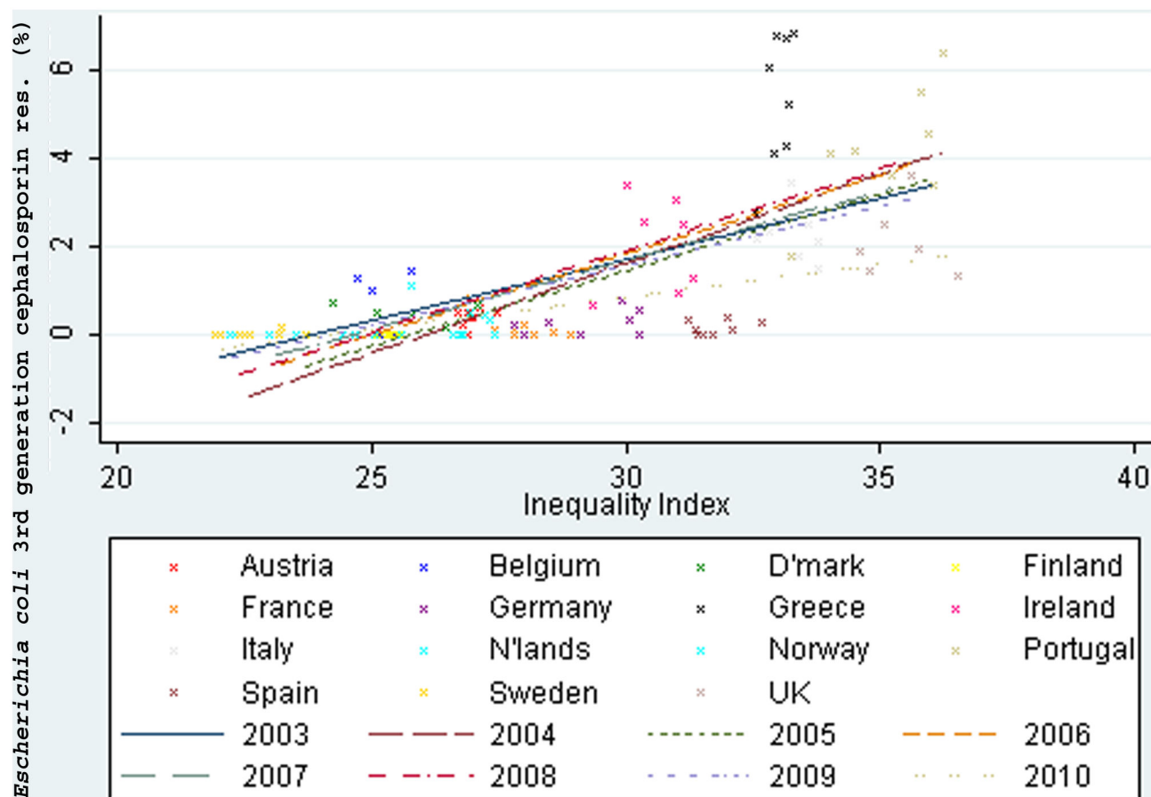
Figure 2. Income inequality correlated with third generation cephalosporin resistance in Escherichia coli (2003-10).