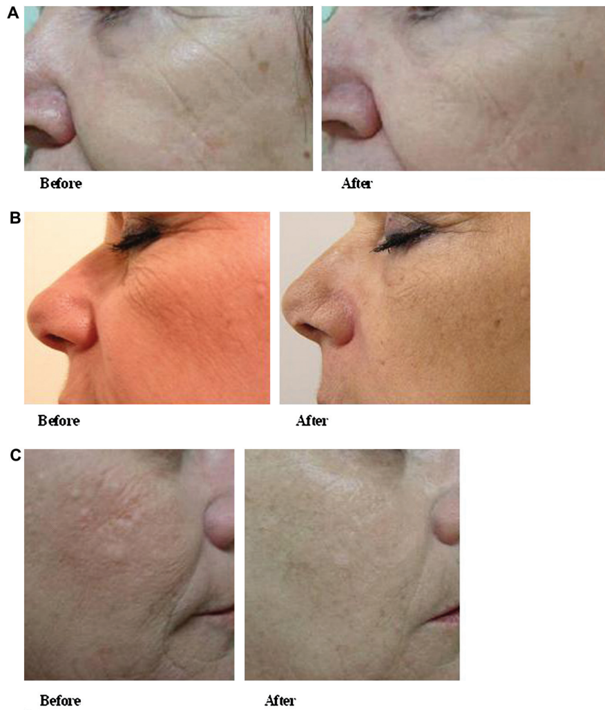
Figure 4. Treatment of facial rhytids. (A) Facial rhytids before and 1 month after two treatments; (B) facial rhytids before and 1 month after three treatments; (C) facial rhytids before and 1 month after four treatments.

option for reversing certain epidermal signs of photoaging, in addition to targeting dermal deficits. This would make the procedure appropriate not only for discrete lesions, as was assessed here, but for