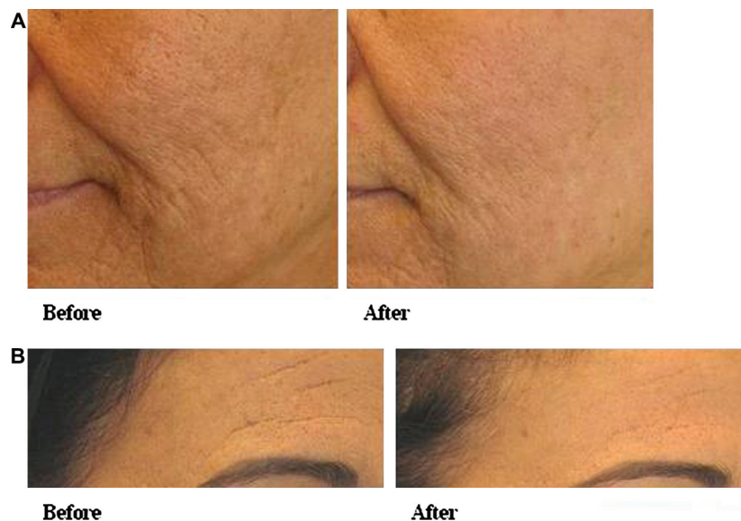
Figure 5. Treatment of facial rhytids. (A, B) Facial rhytids before and 3 months after three treatments.

improving the appearance of entire regions. Given the rapid coverage with the roller tip, which provides treatment of the full face with five passes in 10 minutes, the procedure may be amenable to the treatment of