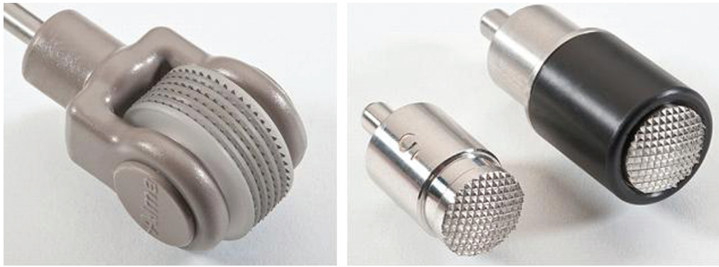
Figure 1. Pixel RF tips, showing the spicules that form the small foci of contact with the skin, in the roller configuration (left) and in stationary tips (right).

range from 100 to 150 mm in depth and from 80 to 120 mm in diameter (Figure 2). The technology improves upon conventional RF by leveraging the generation of plasma to generate focally higher con-