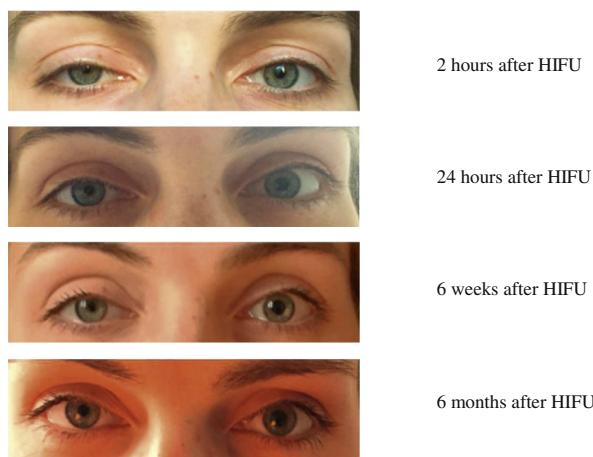
Fig. 3. Right (ipsilateral) Horner syndrome clinical description and follow-up at 2 hours, 24 hours, 6 weeks, and 6 months. Images of the patient’s eyes at each follow-up visit are shown.