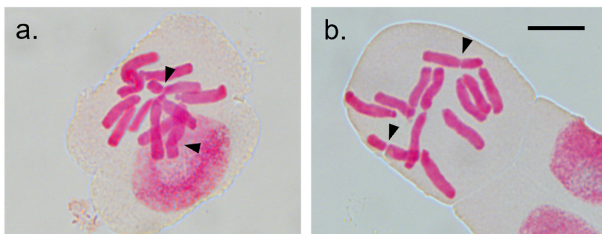
Figure 2. Mitotic metaphase cells of wild (a) and cultivated (b) I. uniflorum plants. (a) Sample AS98; (b) Sample AS247. Arrowheads identify centromeres of submetacentric chromosomes. The bar represents 10 \mu m.

The quantification of the heterogeneity in chromosome size through intrachromosomal asymmetry indexes showed little variation between individuals and regions, all cases displaying A1 = 0.99 , falling in the 1C Stebbins category, and non-significant differences for TF%, Ask% and Syi indexes (Table 2). The interchromosomal asymmetry index A2 also displayed non-significant differences with values close to zero for individuals in the southern ( A2 = 0.077 ) as in the central ( A2 = 0.093 ) areas, reflecting conservation among chromosome size in the karyotype. Yet, variation in some chromosomal parameters from individuals between regions was observed. The largest/smallest chromosome ratio (R) were more variable among individuals from the South ( R = 4.0 ; range 2.3–4.9) in comparison to individuals from the central region ( R = 3.4 ; range 3.1–3.6). Likewise, a wider variation was found in the mean chromosome ratio (long/short arms; r) between individuals from the southern ( 4.2 \pm 0.91 , min 3.1, max 4.7) compared to those from the central ( 4.0 \pm 0.27 , min 3.6 max 4.2) regions (Table 2), as well as the number of chromosome pairs with arm ratio > 2 ( r > 2 ), ranging 2–4 and 2–3 between individuals from the South and the Centre, respectively.