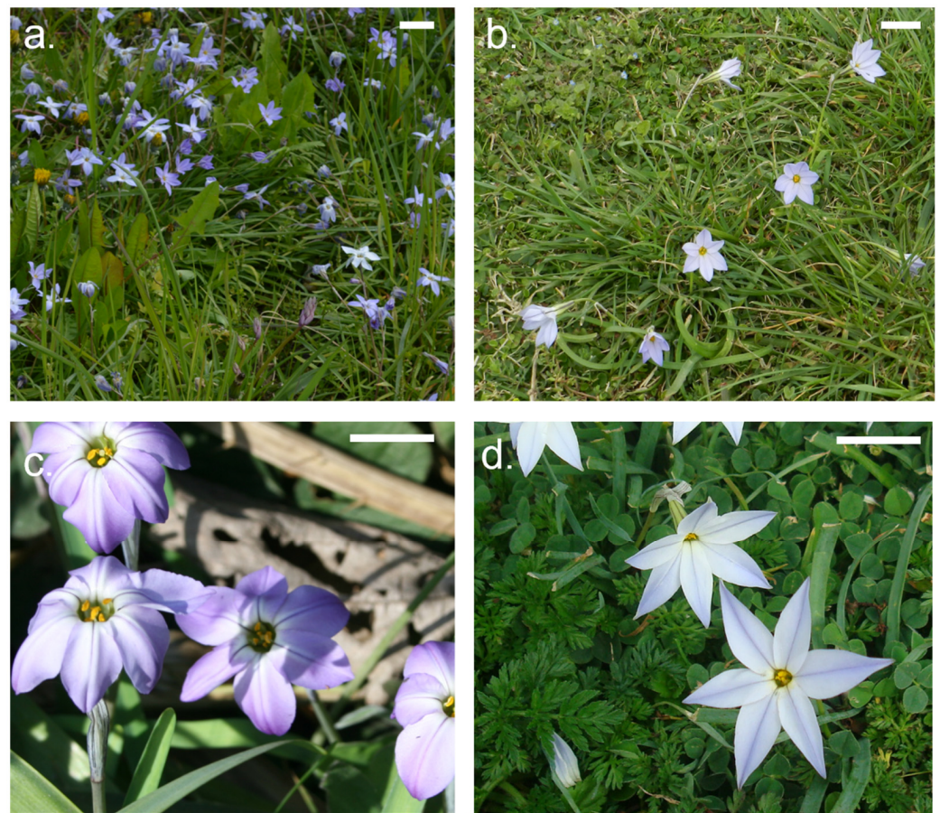
Figure 1. Plate depicting morphological variation of cultivated (a,c) and natural (b,d) materials. (a) Ipheion uniflorum Raf. at BGBM (Berlin). (b) Population of I. uniflorum from the Central region (Azul, Buenos Aires). (c) I. uniflorum ‘Rolf Fiedler’ from Ezeiza Botanical Garden (Argentina). (d) Plants of I. uniflorum from the Central region (Mar del Plata, Buenos Aires). The bar represents 2 cm (a,b) and 1 cm (c,d).

When assessing quantitative characters, the size of the flower exhibited a broad variation within the species from 2 to 3.5 cm length with a tepal fusion from 0.9 to 2 cm (Tables S1 and S2). In addition, our assessment also indicates that the variation in morphological characters found among wild individuals is not significantly different from that observed among cultivated individuals and show no extreme values except for a few plant size measurements (Table S2). Data from different studies and growers (Table S2) indicate that cultivated plants are taller, often reaching up to 30 or 40 cm height, whereas wild plants sizes range from 6 to 20 cm height.