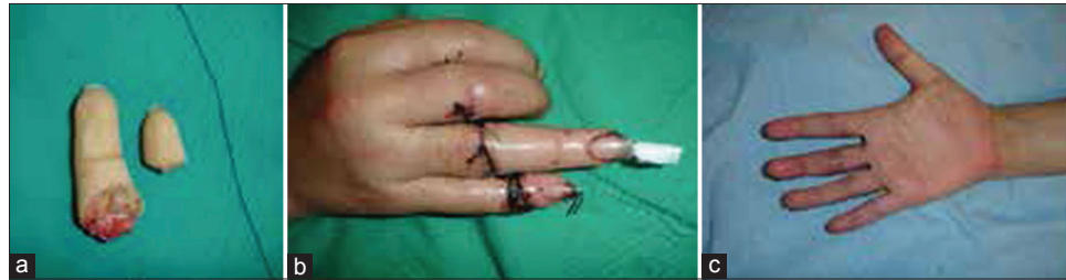
Figure 2: Clinical photograph of a 28-year-old woman with multiple-digit amputation. The fifth finger was amputated at the distal interphalangeal joint level and the fourth finger was amputated at the middle phalanx level by a knife (Tamai zone 2/Yamano type 1), (a) Preoperative amputated stumps (b) 1-week postoperative photograph showing replanted stumps and (c) 2-year postoperative photographs showing well survived fingers

Of the 34 fingertip amputations, 15 were through Tamai zone 1 and 19 were through Tamai zone 2. When all the amputations were classified according to the Yamano classification, 6 were type 1, 8 were type 2 and 20 were type 3. Six patients presented with multiple amputated fingers, of whom 4 underwent multi-digit replantation. None of the multiple amputations required more than one fingertip replantation on the same patient.