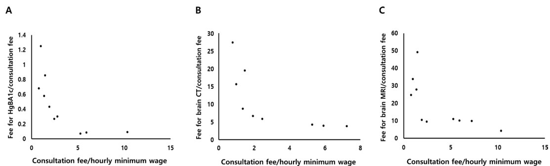
Figure 2 (A–C) shows the correlation between the compensation ratio of consultation/minimum wage and hemoglobin (Hb) A1C/consultation fee (A), brain CT/consultation fee (B) and brain MR/consultation fee (C).

In this study, we aimed to compare physicians' consultation fees (the prototypical fee for physician cognition and evaluation and management services) with the national hourly minimum wage (a socially agreed on wage floor