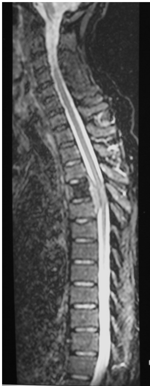
Figure 3 T2W MRI of Thoracic spine.

After discussion with the patient, a decision was made to perform urgent T4 and T5 corpectomies, decompression of the spinal cord and reconstruction of the vertebral bodies. Anterior surgery was contemplated as the compres-