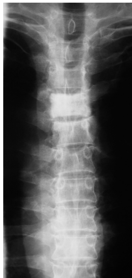
Figure 1 AP X ray of Thoracic spine.

X-rays of the thoracic spine revealed a sclerotic appearance of the T4 vertebral body (Figure 1 & 2) and an urgent Magnetic Resonance Imaging (MRI) showed quite dramatic change in the appearance of T4 compare to the previous CT despite the maintenance of vertebral body height. Furthermore, T5 vertebral body was also involved, but to a lesser extent. There was a soft tissue expansion into the