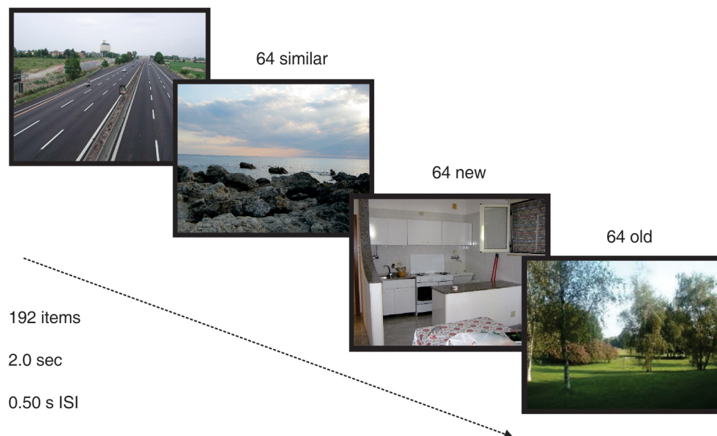
Figure 2 Mnemonic Similarity Task – Context Version (MST-C)

All analyses were conducted in SPSS version 20.0 for Windows. Significance levels were set at p < 0.05 , and the strength of Spearman-Brown coefficients were evaluated according to cutoffs found in the literature 57 (i.e., r from 0.00 to 0.30 negligible correlation; r from 0.30 to 0.50 low; r from 0.50 to 0.70 moderate; r from 0.70 to 0.90 high; r from 0.90 to 1.0 very high correlation).