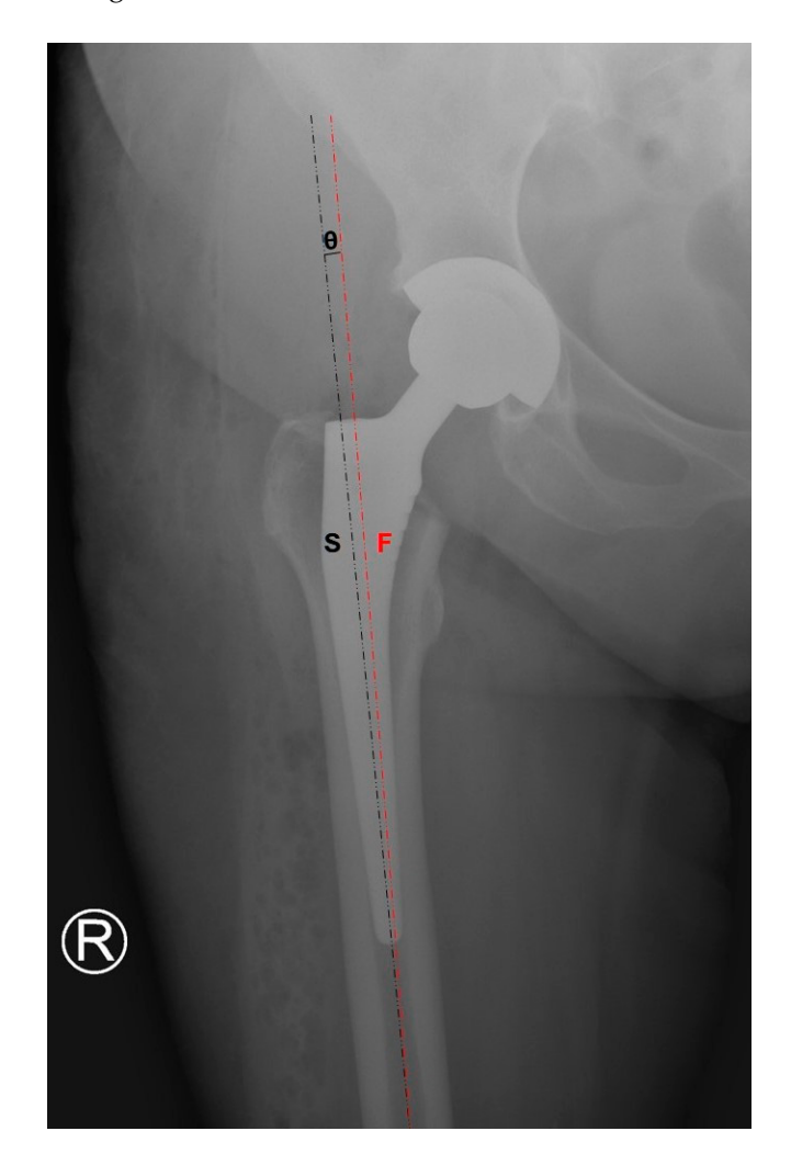
Figure 2. Femoral stem alignment measurement.

the number of participants in the comparative group in Dienstknecht et al.'s research (55 vs. 88). In Brun et al.'s work, there was no difference in the mean femoral stem position between the two trial groups (p = 0.443). In Cheng et al.'s work, the mean femoral stem orientation was -1.60^{\circ} varus. In Reichert et al.'s work, the alignment of the femoral stem was not measured in value, but the researchers provided information stating that the stems in the DAA group were assessed to be in a neutral position in 92.5% of cases, varus in 5.5%, and valgus in 2%, while in the LA group, 94% were positioned neutrally, 4% varus, and 2% valgus. In Taunton et al.'s work, the researchers remarked that in the DAA group, there were four stems in varus, while in the PA group, there were six stems in varus and two in valgus.