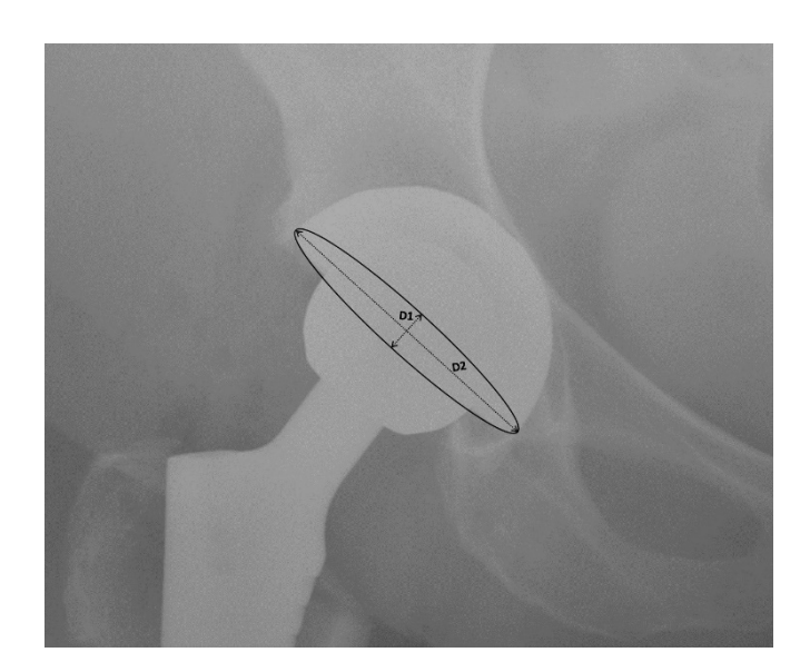
Figure 4. Cup anteversion measurement.