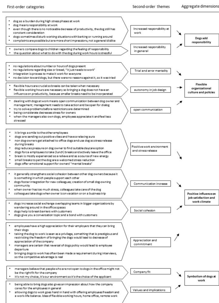
Figure 4. Data structure.

In the third step of the analysis, the 12 major categories were brought together into four unique aggregate dimensions. For this, the relations between first-order themes and second-order categories were examined, and the overarching concepts regarding the influence of dogs in companies were captured. Further texts from the literature regarding employee satisfaction, culture, and policies were consulted, to compose independent but relevant dimensions. For example, the trial-and-error mentality, autonomy in job design, and open communication all point in the direction of a flexible organizational culture in which employees with dogs felt able to bring the dog and deal with the extra burden thus entailed. It became evident that these points were prerequisites to benefit from dogs in the office. From this analysis, the data structure, as shown in Figure 4, was formed.