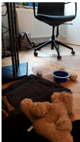
Figure 1. Dog's place in the office.

Allowing dogs into the office also symbolizes a sense of values that applicants, as well as employees, can (or cannot) identify with [43]. According to social identity theory, people derive their self-concept from their membership in certain social groups and therefore join companies that fit their own values and are staffed with people similar to themselves [55]. Pet-friendly policies might help employees and applicants who are dog-owners, dog-friendly, or are more relaxed in general about rules and regulations to identify with a company. Seeing a dog in the office or a dog's place at a desk (as seen in Figure 1) might have an impact on the applicant's perception of the company. Consequently, pet-friendly policies can be an important component of the decision for or against applying for a specific job and have a role in employer branding [40,41].