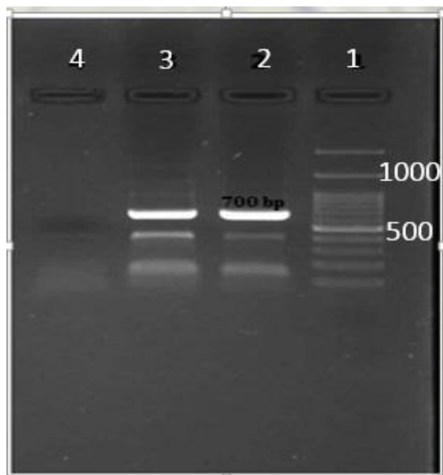
Fig. 2: Gel electrophoresis of the conventional PCR of Fasciola hepatica ITS1 DNA. 1. DNA size marker 100 bp. 2. Positive control 3. Positive control 4. Negative control