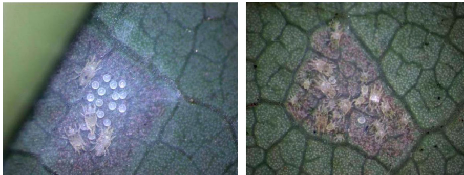
Figure 1: Oligonychus perseae nests on the underside of avocado leaves. Left: new nest containing eggs and adults. Right: old nest containing all life stages and showing the necrotic leaf tissue underneath. The body width and length of females (the larger specimens in the photo) are 0.17 × 0.32 mm.