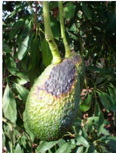
Figure 3: Sunburnt avocado fruit subsequent to severe defoliation caused by O. perseae