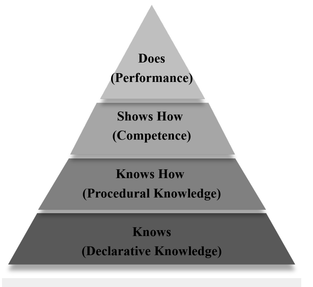
FIGURE 2: How simulation-based education fits with other forms of teaching and learning

An adaptation of an assessment metrics of clinical competence was used to illustrate where SBL fits with other forms of teaching and learning [14]. Specifically, teaching and assessing the basic knowledge happens through readings, lectures, and paper-based tests ("knows"). Simulation supports procedural knowledge and skills through the use of illustrations and demonstrations ("knows how"). Lastly, it is particularly important in the development and assessment of procedural skills and individual/team management of a patient context, which aligns with ("shows how"). In traditional approaches to education, the "shows how" occurs on real patients in the clinic environment.