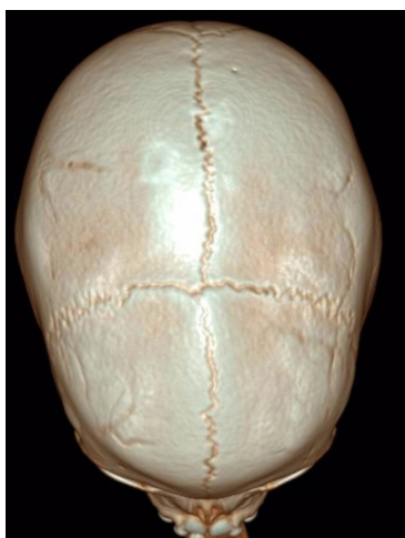
Fig. 3. Computerized tomography scan with three-dimensional reconstruction showing no occipital bossing or frontal bossing.

ing and attention from the craniofacial surgical community, the literature would suggest an increased finding for this rare occurrence with great variation in phenotypic presentations in syndromic and non-syndromic patients [3]. Eley et al. [4] suggest that one may be under estimating or not detecting these minor suture involvements and their role in craniofacial development. Smartt et al. [5] reported the largest cohort study of squamosal synostosis, in which they highlight the varied nature of presentation with many presenting as part of a multisuture synostosis pattern. His isolated bilateral synostosis cases both presented with some form of occipital flattening.